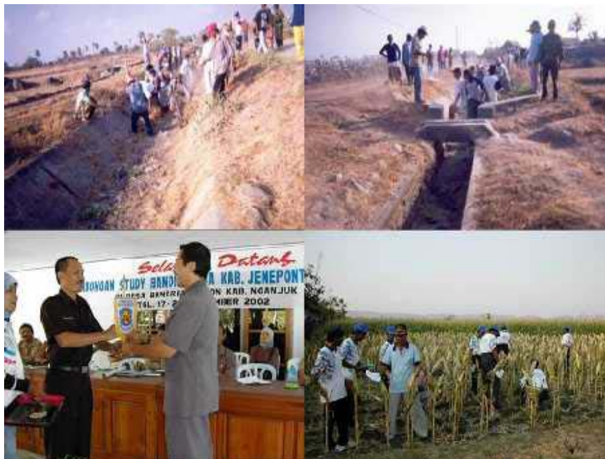
Figure 1. Public Participation for the Karalloe dam and Kelara irrigation scheme.